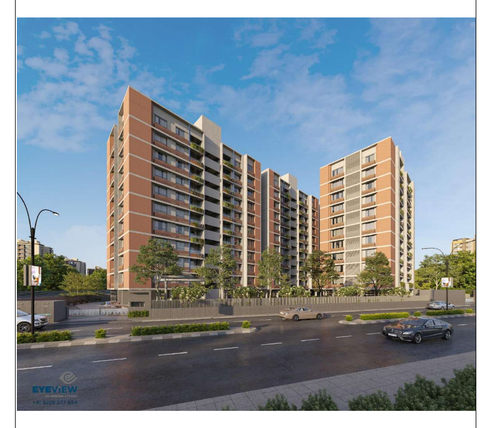
Shree Vishnudhara Essence, Thaltej, Ahmedabad